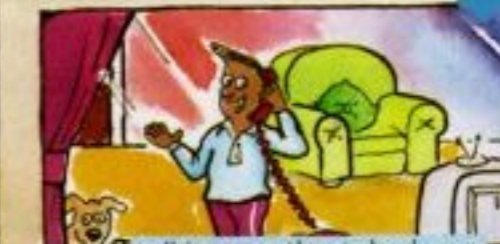
talking on the telephone